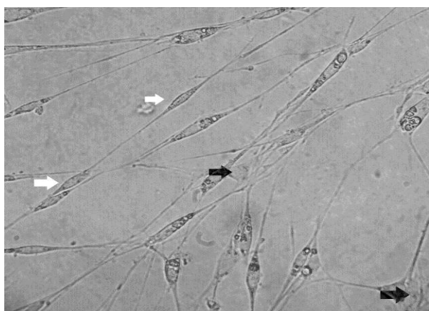
Fig. 2. Two types of cells are present: Fibroblasts (black arrow) with flat polymorphic forms, larger nuclei, and larger cytoplasm. Schwann cells (white arrow) had bipolar or tripolar spindle shapes and smaller sizes (20×).

After 48 hours of primary cell culture, Schwann cell purification was performed by changing the concentration of FBS. In the first group, the numbers of fibroblasts increased after 72 and proliferated more quickly than Schwann cells. In groups 2 and 3, the concentration of FBS was reduced, and on days 5 and 6, the number of fibroblasts significantly changed (Fig. 2). The purity of Schwann cells at FBS concentrations of group 1 (10%), group 2 (5%), and group 3 (2%) were 93.42%, 91.25%, and 97.83%, respectively.